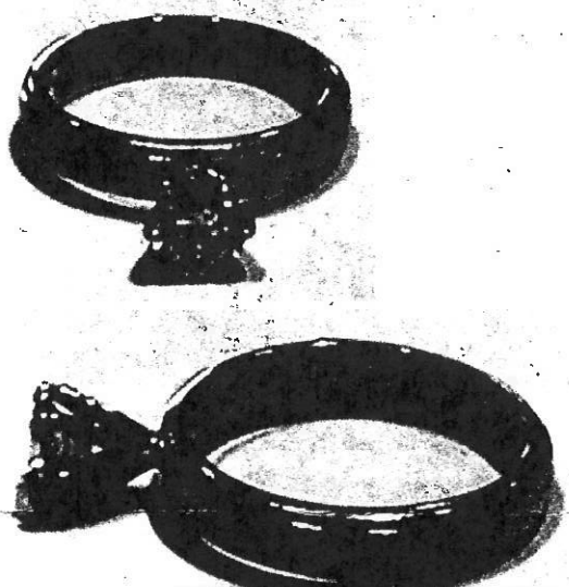
PHOTO OR SKETCH with Stone References